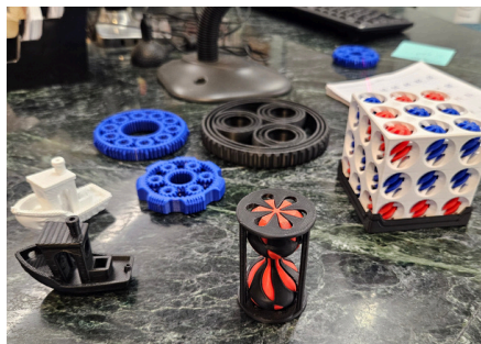
The Library's new 3D printer (on the left), as well as a collection of 3D printed items created using this new community resource.

Toys, phone cases, glasses or earbud cases, games, jewelry, tools, parts, sculptures, planters, food containers (FYI: the plastic used at the Winchester Library's 3D printer is non-toxic and compostable), the list goes on and on.